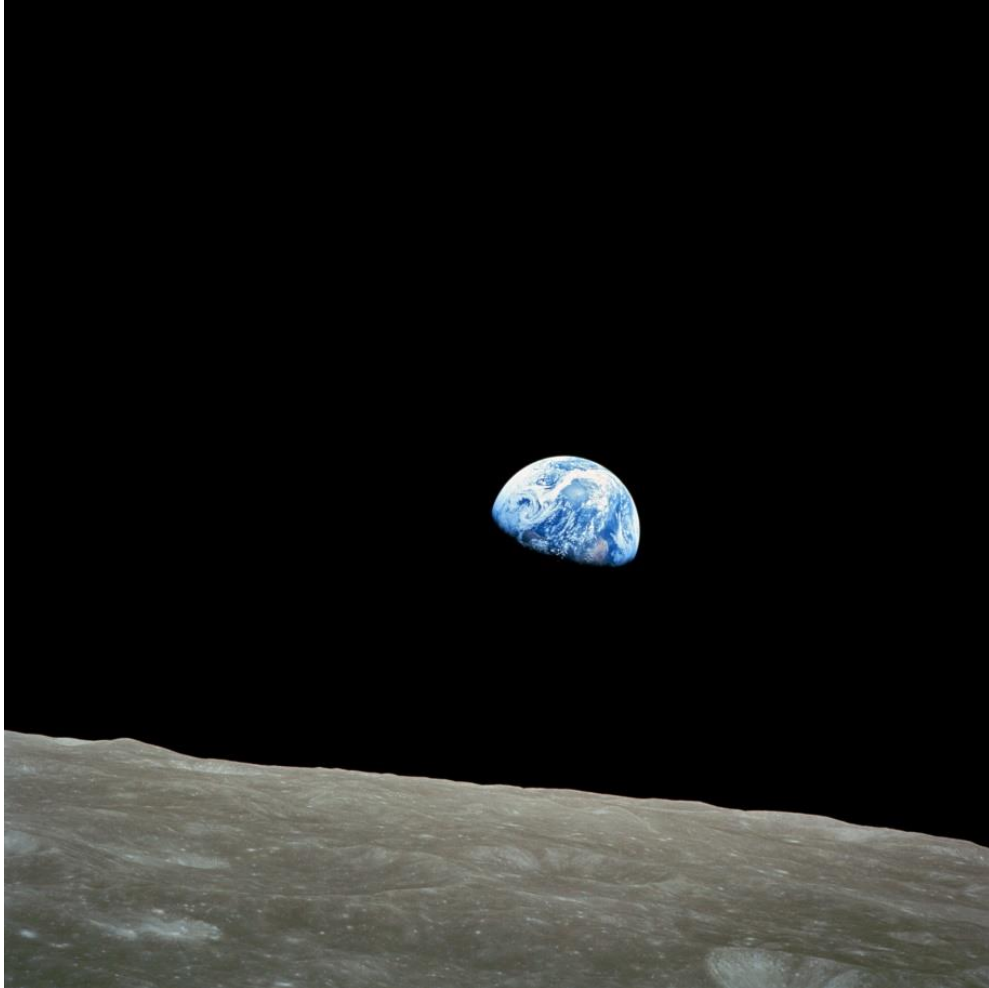
Figure 2 – Earthrise, taken by William Anders (Apollo 8) after the crew’s fourth orbit around the Moon, immortalised the first time humans witnessed in person the rising of Earth from the lunar horizon. Credit: NASA

places, situations, and environments”, and ultimately helping to redefine what it means to be human. 45